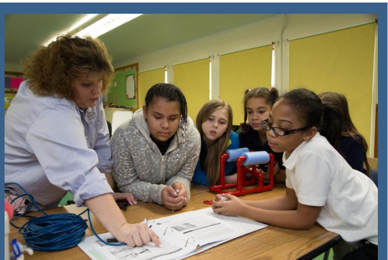
Tulsa Public Schools photo by Tracy Kouns.

http://www.acs.org/content/acs/en/funding-and-awards/grants/hachhighschool.html