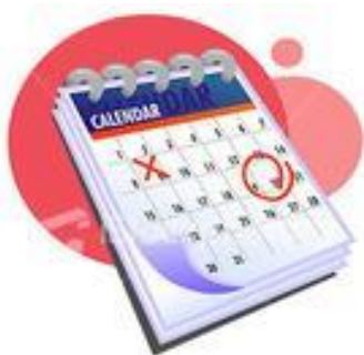
Basic: Fall Schedule - TBA

Contact us to schedule a workshop at your school – at your convenience!