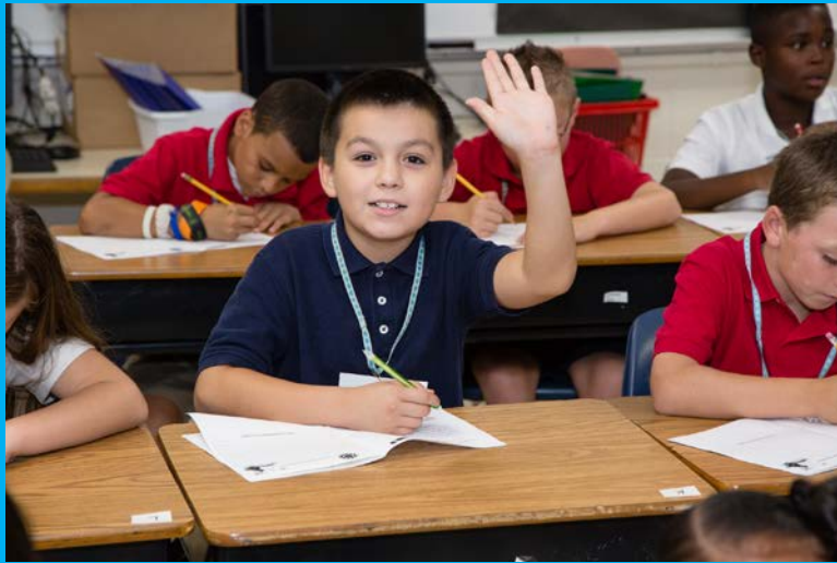
Tulsa Public Schools photo by Tracy Kouns.